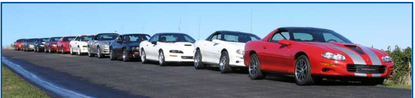
Another great turnout of Camaros for this year's Fall Color Tour!