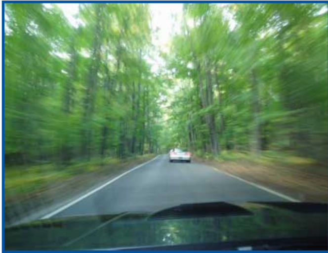
The WMCC Fall Color Tour was just a BLUR! .... Perfect!

Don't miss the next WMCC Club Meeting Sunday, November 6. We will be meeting at B & G Discount in Schoolcraft at 11am for the color tour cruise to Paisanos Bar and Grill in Three Rivers for lunch and our Club meeting.