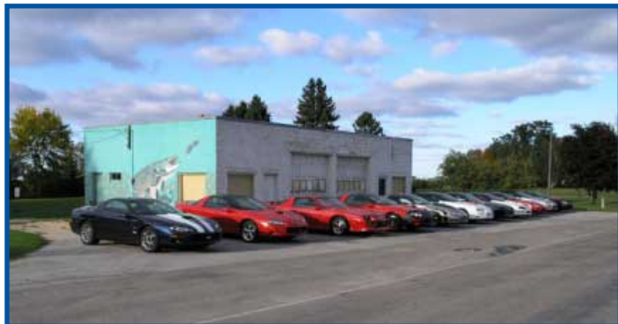
Taking advantage of a great photo op at the Legs Inn in Cross Village.