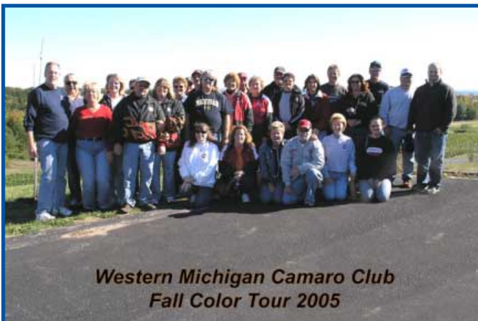
Western Michigan Camaro Club Fall Color Tour 2005