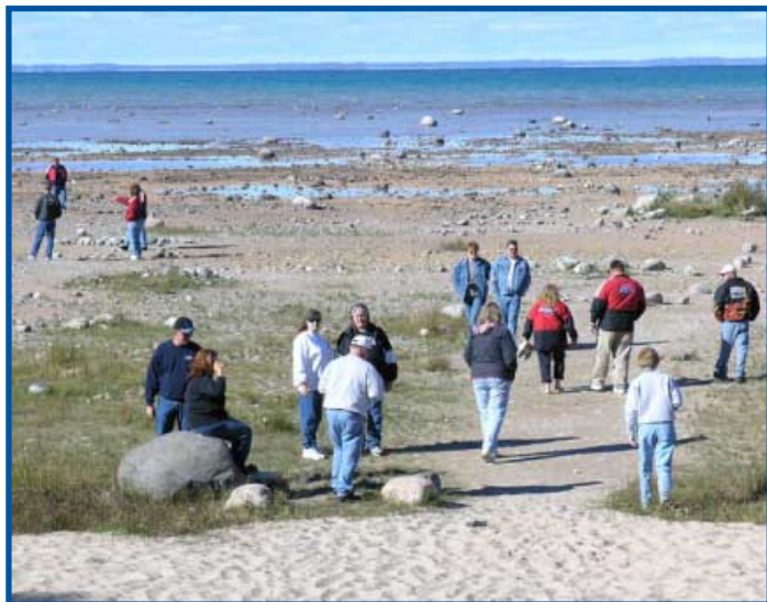
Spending some time at Mission Point.