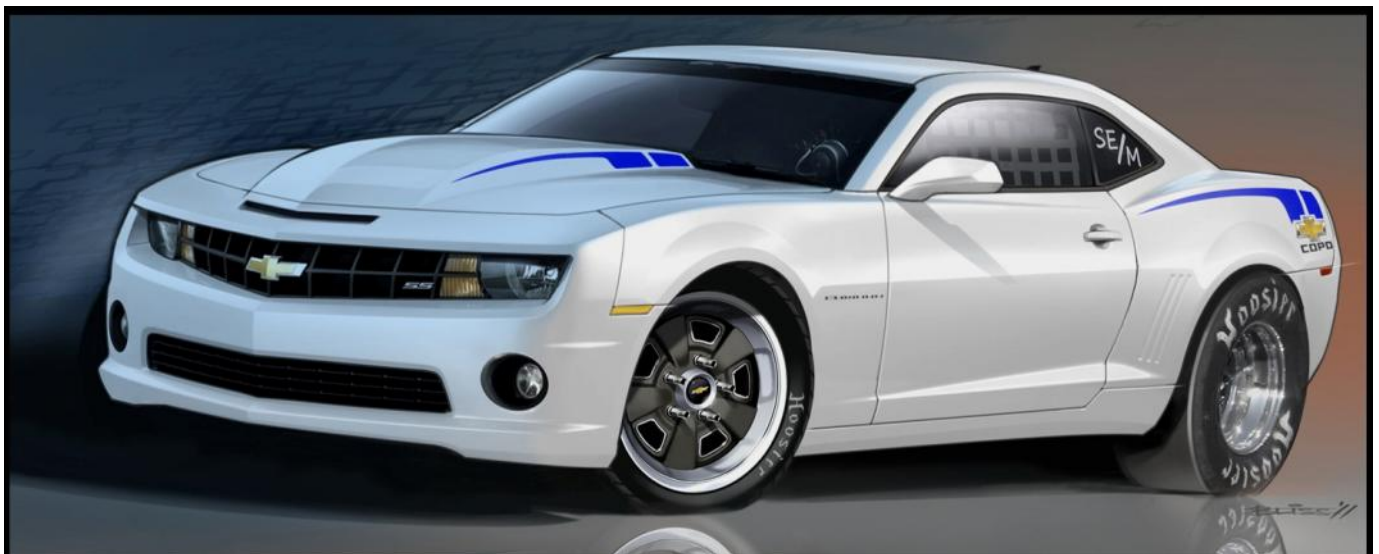
2011 COPO Camaro Concept