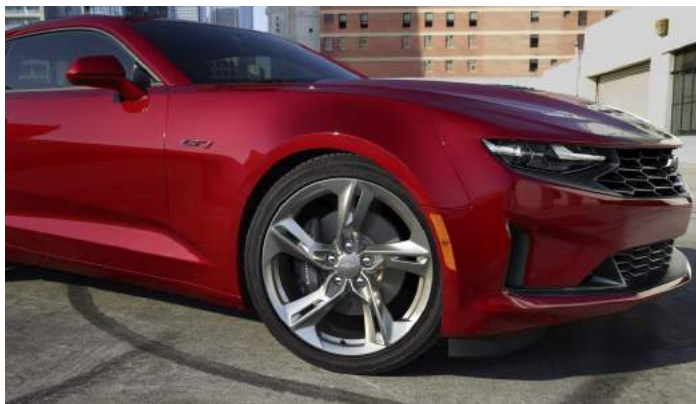
2020 Camaro LT1 Exterior

Addition of Camaro LT1 model, which is powered by the 6.2L V8 LT1 engine making 455 horsepower (339 kW) and with a starting MSRP of $34,9951 (including destination); it slots below the Camaro SS in the 2020 Camaro lineup