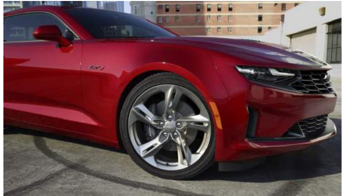
2020 Camaro LT1 Exterior

Addition of Camaro LT1 model, which is powered by the 6.2L V8 LT1 engine making 455 horsepower (339 kW) and with a starting MSRP of $34,9951 (including destination); it slots below the Camaro SS in the 2020 Camaro lineup