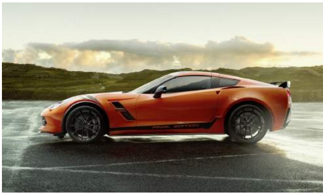
C7 Corvette Grand Sport Final Edition

GM introduced the EU-exclusive C7 Corvette Final Edition earlier this year, which serves as the last hurrah for the C7 Corvette (and likely front-engine Corvettes altogether) in Europe. It is available as both a Corvette Grand Sport or a Z06 and is set apart by its Final Edition decals and Sebring Orange Tintcoat Metallic or Ceramic Matrix Gray Metallic paint. The Final Edition is offered in Germany and Switzerland only, with the Grand Sport Final Edition starting at 116,500 euros and the Z06 Final Edition starting at 139,500 euros.